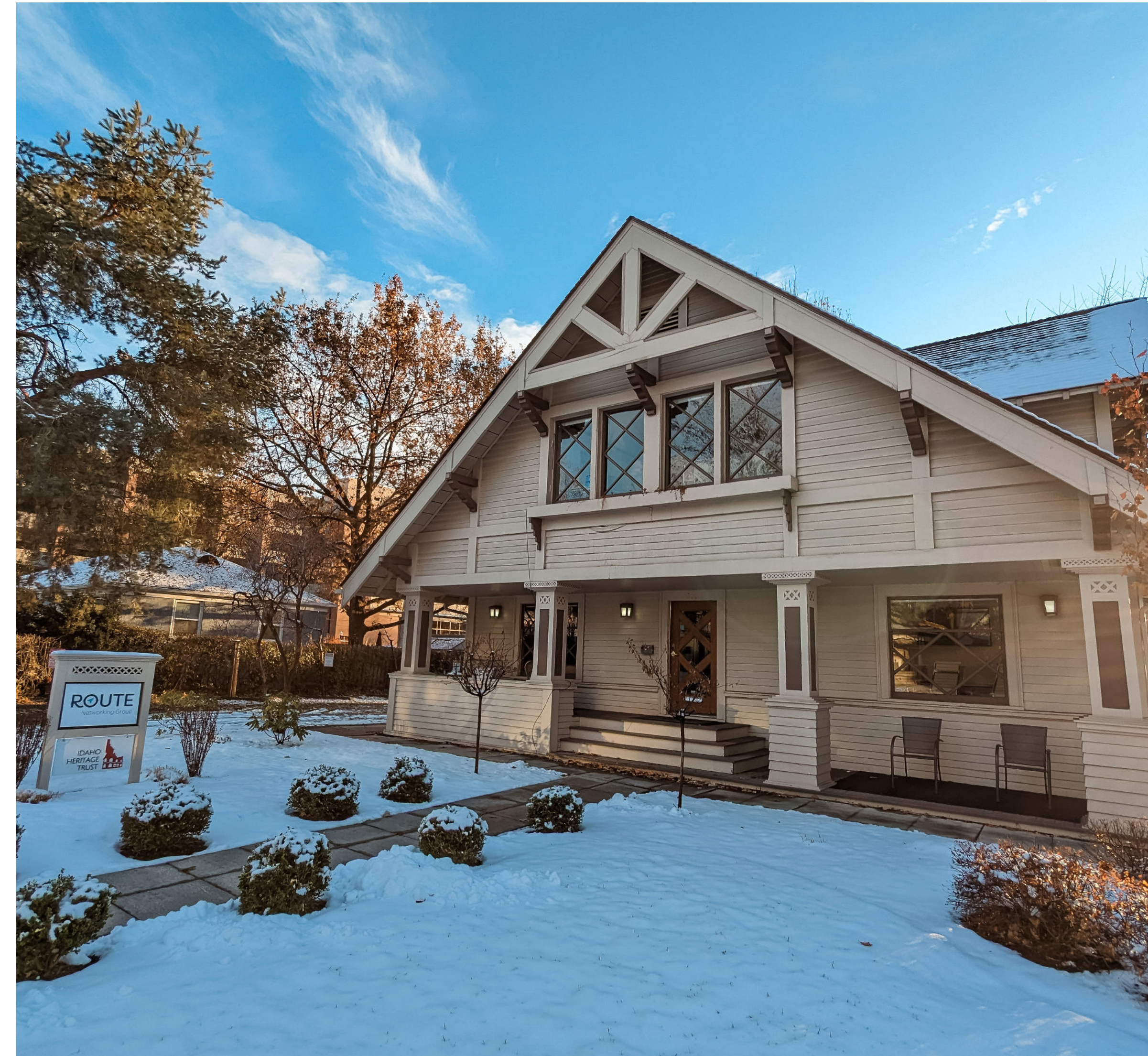
Featured photo (above) is the Governor Morrison Home in Boise, Idaho.